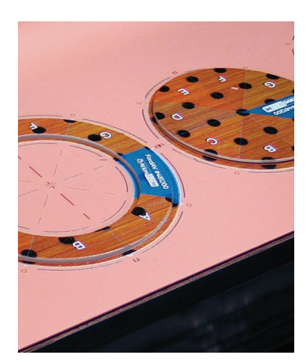
A CUSTOM LENS WITH SEVEN SLIGHT COLOR VARIATIONS WILL BE SHIPPED FOR CUSTOMER SELECTION. ONCE A FINAL COLOR SAMPLE SELECTION IS PROVIDED, A FINAL MOCKUP WILL BE SHIPPED FOR CUSTOMER APPROVAL.