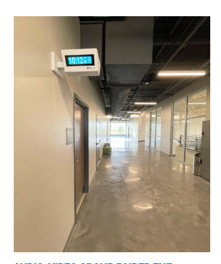
AUDIO-VIDEO GROUP PAIRED THE CUSTOMIZABLE COMMUNICATIONS PLATFORM WITH A COMBINATION OF ROUGHLY 100 ATLASIED SPEAKERS AND IPX SERIES ENDPOINTS

For Pierce, and the rest of the AV integration team, AtlasIED's enterprise-class GLOBALCOM.IP system was the obvious choice, given its installation and configuration flexibility. Audio-Video Group paired the customizable communications platform with a combination of roughly 100 AtlasIED speakers and IPX Series endpoints to ensure that guests and employees—whether on the basketball court or in the swimming pool, taking an outdoor yoga class or running on the track—can hear and see routine and emergency notifications.